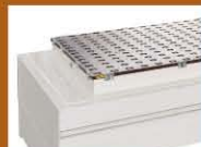
Raising table type

To meet various processing requirements, Table type can be selected from [Flat table type] or [Raising table type].