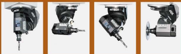
Vertical Horizontal Inclination Saw blade