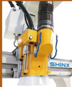
Low speed 5kW electrospindle