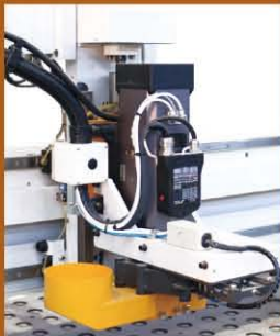
6.6kW ATC electrospindle