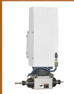
Horizontal double-headed spindle